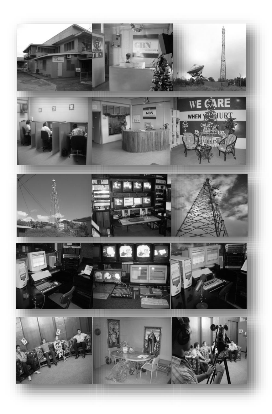
GBN Television and Radio Ministry in Samoa