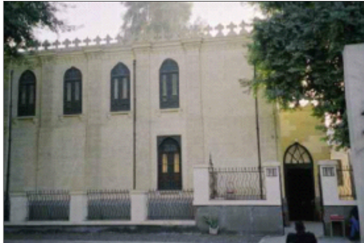
Ben Ezra Synagogue, Old Cairo.

The oldest surviving synagogue in Egypt was built in 882 CE and located in Old Cairo. It is known as the Ben Ezra synagogue. At the end of the 19 th century, an historian was able to remove for study an attic full of books and community records dating back to the 11 th and 12 th centuries, preserved by the characteristically dry climate of the region.