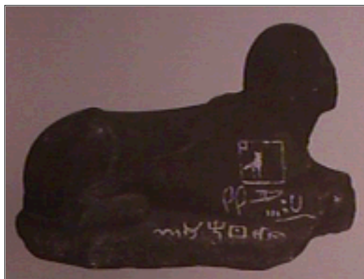
Sphinx discovered by Petrie at Serabit El Khadim.

On the west coast of the Sinai Peninsula - the great and terrible wilderness of the Exodus - at a place called Serabit El Khadim, the Egyptians mined turquoise. Turquoise is a semi precious stone found alongside copper ore. The workers in the mines were a Semitic people, perhaps contemporary with the Israelite sojourn in Egypt, although probably not including them given the nature of their religious practices. However, they spoke a language very similar to Hebrew. In 1905, Sir Flinders Petrie discovered several artefacts including the Sphinx pictured here. They were engraved with an alphabetic script and classical hieroglyphics, both stating the same message. A similar happy coincidence occurred with the famous Rosettastone (found at Rashid in Egypt by Napoleon's soldiers) which allowed scholars to work from the known Greek to the then undeciphered Hieroglyphics. It is believed the alphabet we use today had its origins in this so named proto-Sinaitic script. Scholars can trace its development through Greek, to the European Alphabets in use today. It became the basis of such widely different alphabets such as Sanskrit, Arabic, Cyrillic and Thai.