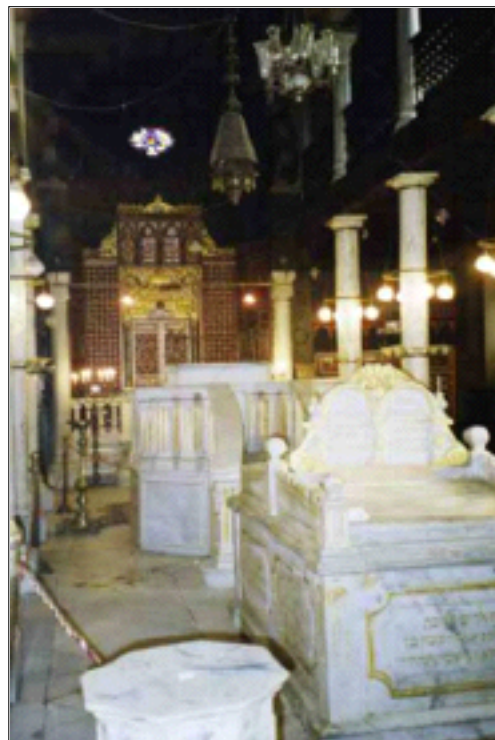
Ben Ezra Synagogue interior, with genizah visible in the background.