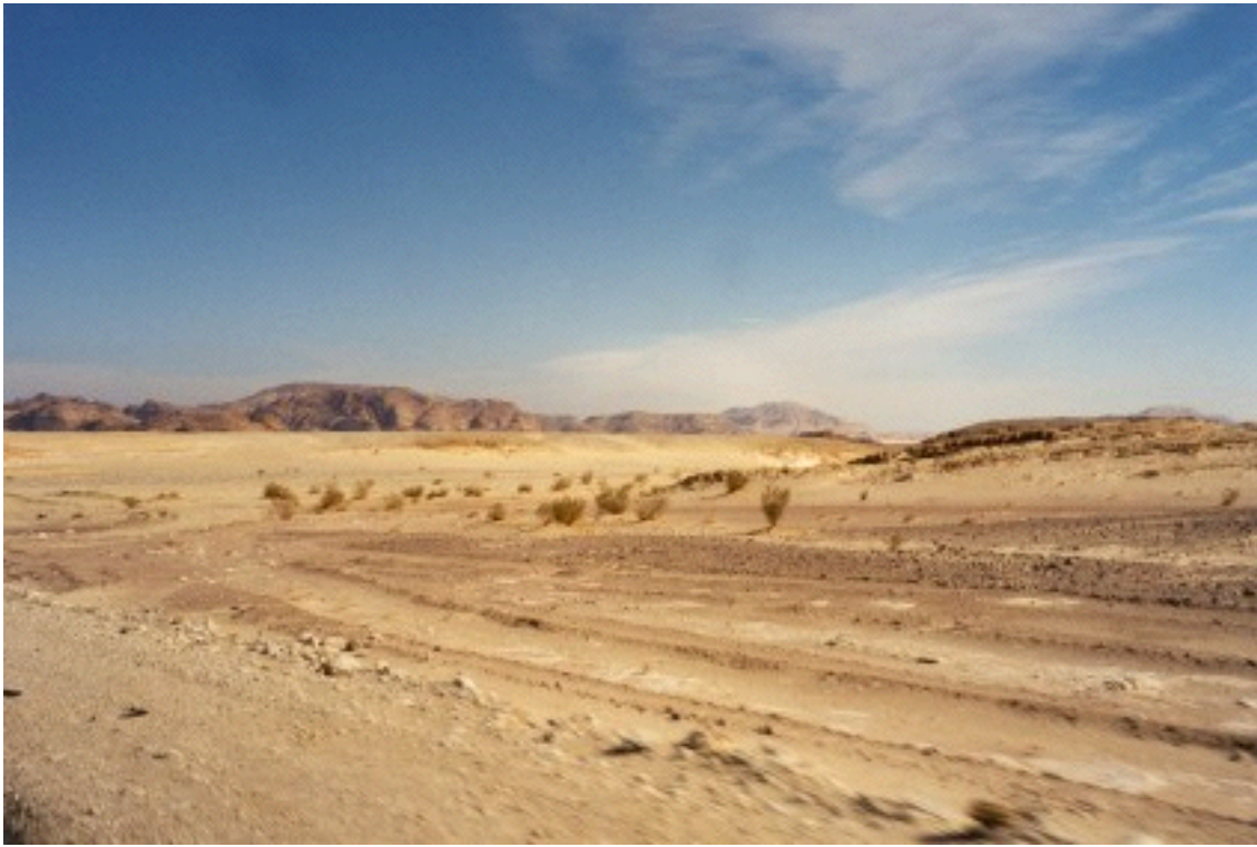
Somewhere on the road south of Dahab, eastern Sinai Peninsula...