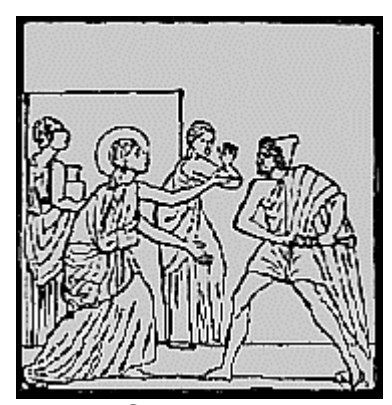
Circe, daughter of the well known Sun-deity Helios. This "Circe" is the identical Old English word for "Church"—see any dictionary.

Ecclesiastical sources give the origin as kuriakon or kyriakon in Greek. However, to accept this. one has to stretch your imagination in an attempt to see any resemblance. Also, because kuriakon means a building (the house of Kurios =Lord), and not a gathering or meeting of people, as the words ekklesia and qahal imply, therefore this explanation can only be regarded as distorted, even if it is true. Our common dictionaries, however, are honest in revealing to us the true origin. They all trace the word back to its Old English or Anglo-Saxon root, namely circe . And the origin of circe ? Any encyclopaedia, or dictionary of mythology, will reveal who Circe was. She was the goddess-daughter of Helios, the Sun-deity! Again, another form of Sun-worship, this time the daughter of the Sun-deity, had become mixed with the Messianic Faith.