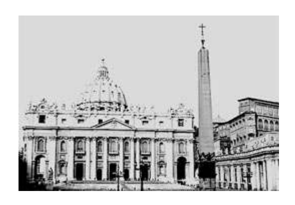
FIG. 6: Obelisk in front of St. Peter's.

The majority of church buildings that have been built over the centuries have a tower. Each generation of church builders has copied the former generation, probably never questioning the origin of the idea. The Scriptural Temple of Yahúweh does not have a pointed tower or pointed pillar in its design. Similar to the sun-pillar or obelisks, these pointed towers of churches can be traced back to Babylon. Many of the towers that were built in the Babylonian empire were not watchtowers, but were religious towers. In those times, a stranger entering a Babylonian city would have no difficulty locating its temple, we are told, for high above the flat roofed houses, its tower could be seen.210 We are also told by The Catholic Encyclopedia, "It is a striking fact that most Babylonian cities possessed a ... temple-tower."211 Whether it be a tower, a steeple or a spire, they are all un-Scriptural. Several writers think, and not without some justification, the towers, steeples and spires with the ancient obelisk. "There is evidence," says one, "to show that the spires of our churches owe their existence to the uprights or obelisks outside the temples of former ages."212 Another says, "There are still in existence today remarkable specimens of original phallic symbols ... steeples on churches ... and obelisks."213