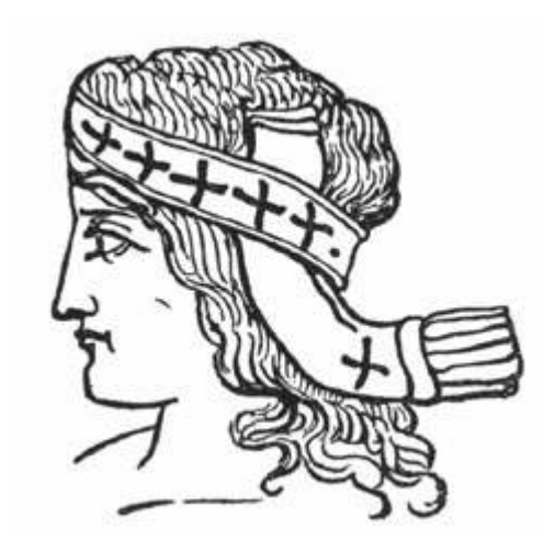
FIG. 4: This is Tammuz, whom the Greeks called Bacchus, with the crosses on his head-band.

numerous other sects of India, also used the sign of the cross as a mark on their followers' heads.101 "The cross thus widely worshipped, or regarded as a 'sacred emblem', was the unequivocal symbol of Bacchus, the Babylonian Messiah, for he was represented with a head-band covered with crosses."102 It was also the symbol of Jupiter Foederis in