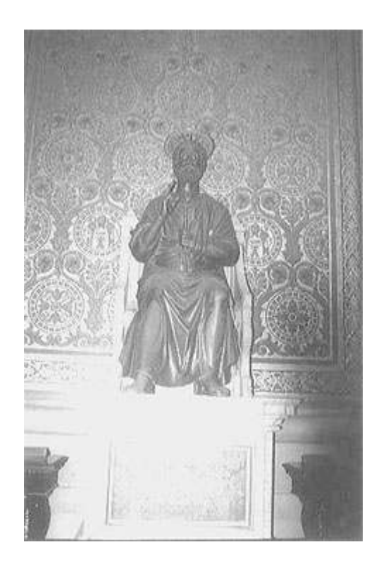
FIG. 7: Vatican statue of Peter, originally an image of Jupiter!

Not only have various names, surnames, and name-derivatives of the ancient Sky-deity (Zeus, alias Jupiter) been retained in the religion of the Western World, but above all, we find that an even more tangible form of Zeus- or Jupiter-worship exists, to this present day. It is commonly known, and also told by the guides of the Vatican, that the bronze statue of "St. Peter" in St. Peter's in Rome is but only the ancient pagan image of Jupiter,